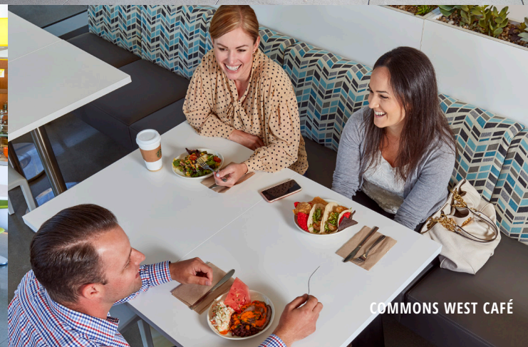
COMMONS WEST CAFÉ