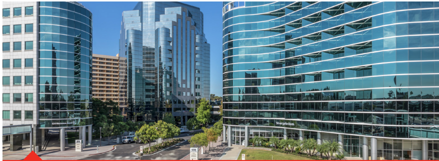
YOUR WORKPLACE COMMUNITY