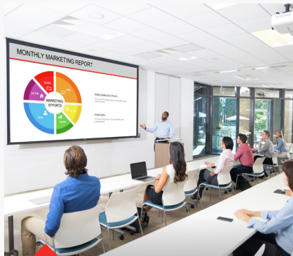
MEETINGS & EVENTS