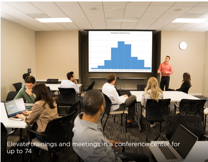
Elevate trainings and meetings in a conference center for up to 74