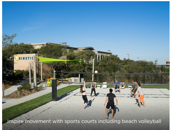
Inspire movement with sports courts including beach volleyball