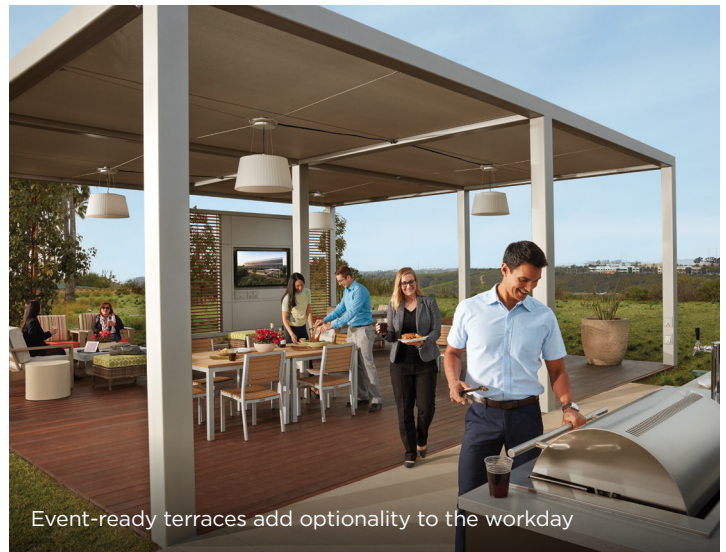
Event-ready terraces add optionality to the workday