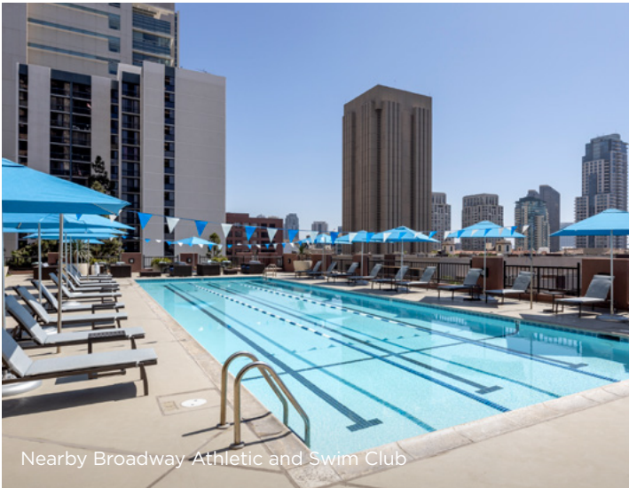
Nearby Broadway Athletic and Swim Club