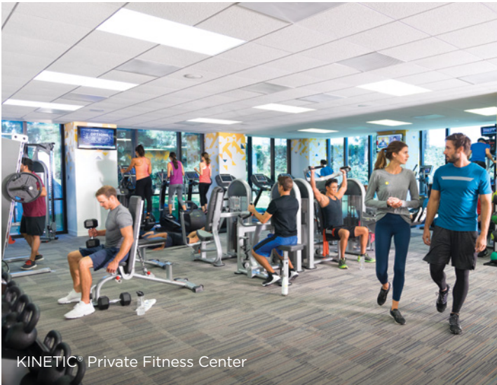
KINETIC® Private Fitness Center