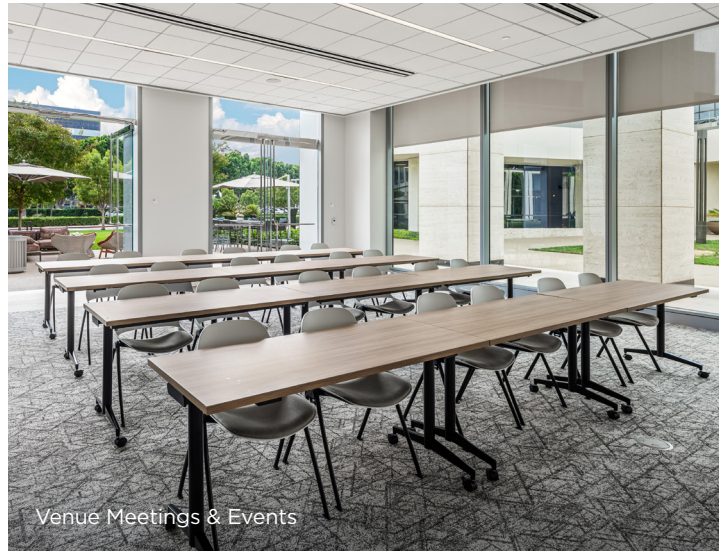
Venue Meetings & Events