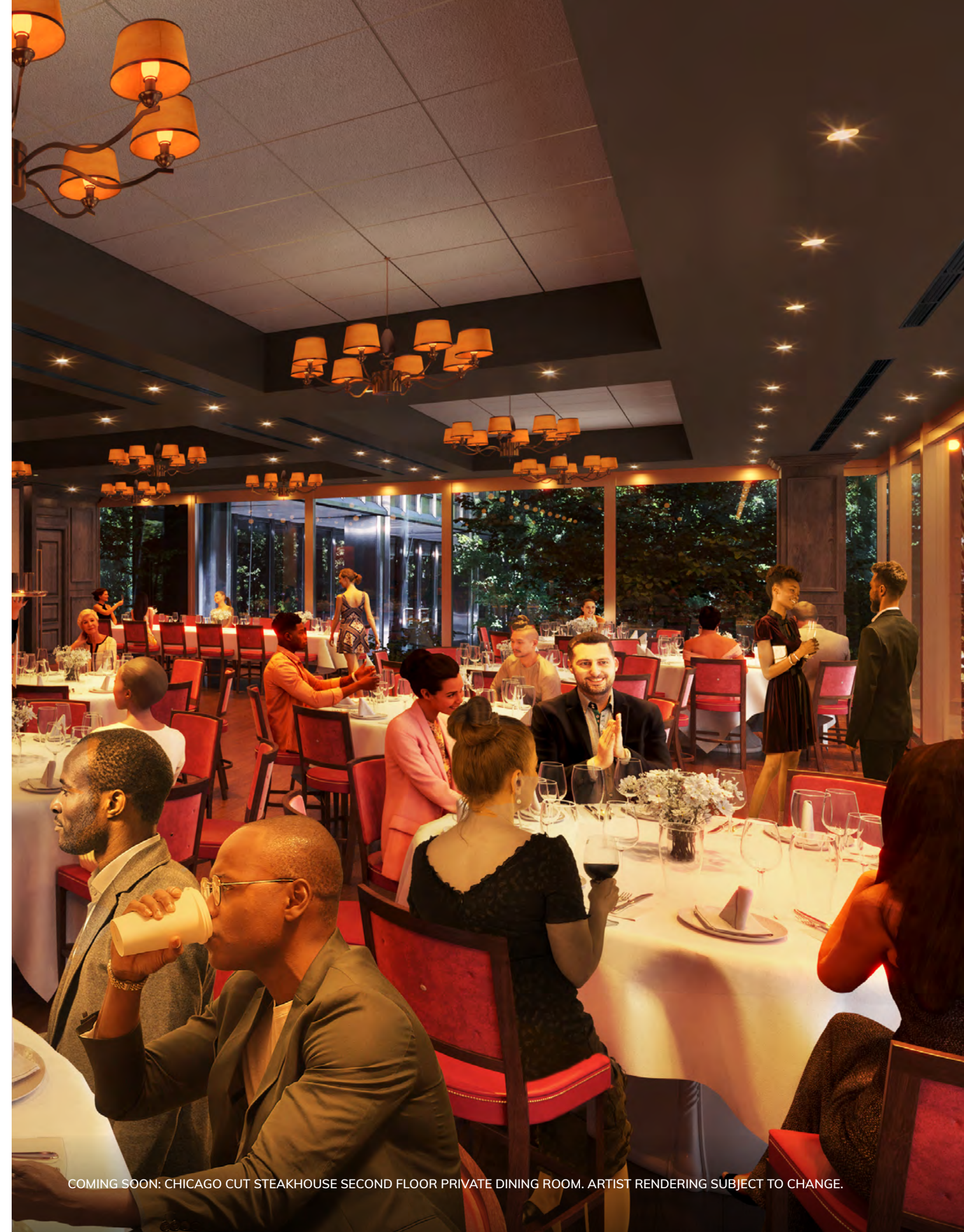
COMING SOON: CHICAGO CUT STEAKHOUSE SECOND FLOOR PRIVATE DINING ROOM. ARTIST RENDERING SUBJECT TO CHANGE.