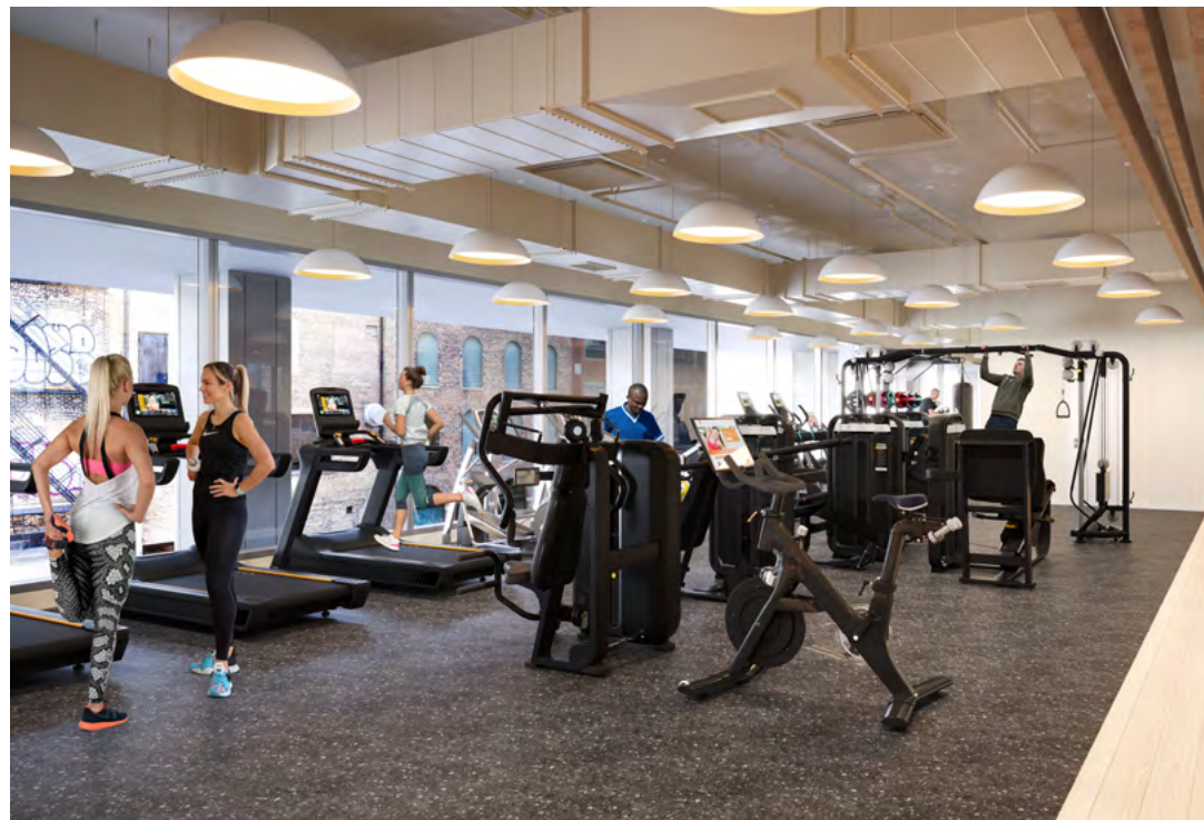
COMING TO 300 NORTH LASALLE: ELEVATED FITNESS CENTER WITH GROUP CLASS STUDIO ROOM. ARTIST RENDERING SUBJECT TO CHANGE.

Our indoor-outdoor riverfront terrace, 24-hour KINETIC® fitness center, and meeting & event space are just a few of the elevated experiences that entice employees to work from the office.